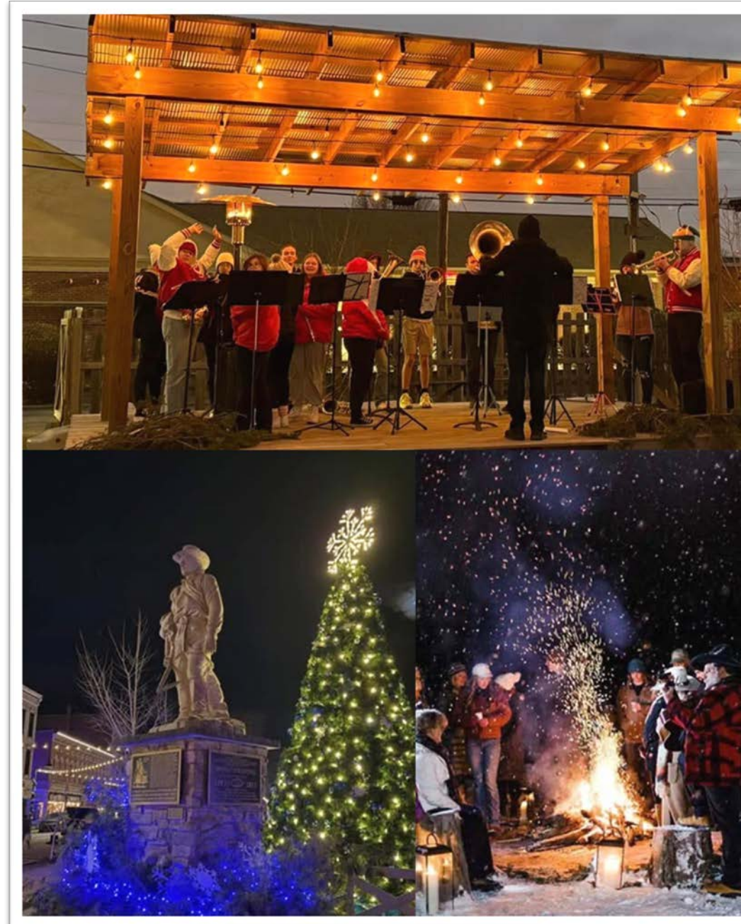
Images from Winterfest, Downtown Connersville